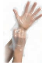
Disposable gloves (2x)