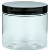
Textured coating 100ml